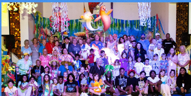
SCUBA VBS 2024

Thank you once again to everyone who contributed to making this July unforgettable. Your kindness, generosity, and commitment to our children and youth are the building blocks of a strong, loving community. Let us continue to work together, creating an environment where every child feels valued, supported, and loved. Here's to many more joyful and impactful moments ahead!