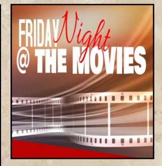
Friday Night at the Movies: Cabrini Fri, June 13th 6:00PM Free