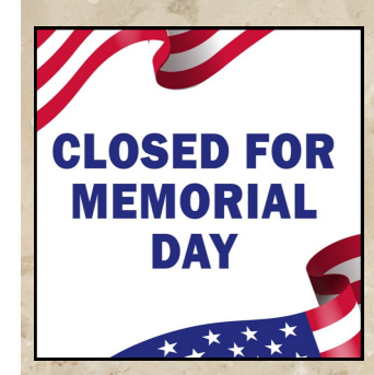
Church Office Closed Memorial Day Mon. May 26th