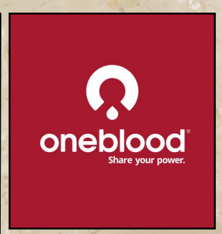
OneBlood Blood Drive Sun. June 1st 8:00AM - 1:00PM